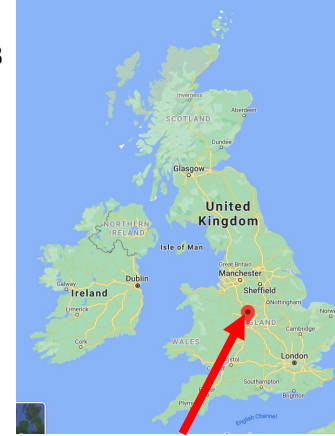
Bournville – England

Bournville is a village roughly 23 miles from Tamworth on the South west side of Birmingham, England, founded by the Quaker Cadbury family for employees at its Cadbury's factory. Cadbury's is well known for chocolate products – including a dark chocolate bar branded Bournville .