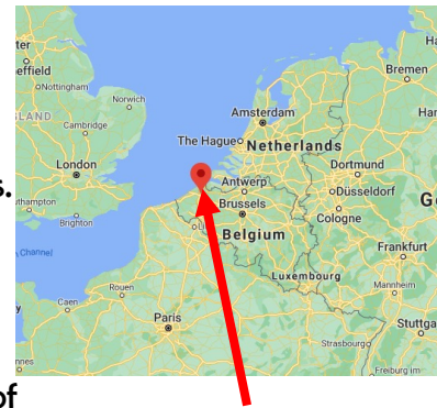
Bruges – Belgium

Belgium is a country in Europe. It shares its borders with 4 other countries: France, Germany, Luxembourg and the Netherlands. Bruges is a beautiful city in Belgium which is famous for its old medieval buildings, cobbled streets and canals. People visit Bruges every year to see the wonderful architecture, such as the Belfry Tower and the Church of Our Lady and of course to visit the many chocolate shops in the cobbled city.